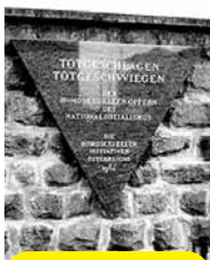
Commemorative plaque in Mauthausen