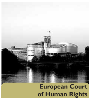
European Court of Human Rights

On 25 January 2005, the European Court of Human Rights delivered a judgement in the case of Enhorn v. Sweden (application no. 56529/00).