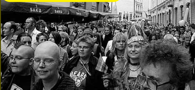
First Baltic Pride 2004

This year the Estonian capital of Tallinn will host second Baltic Pride. The first ever LGBT pride event in the Baltic countries took place in Tallinn last summer and offered a variety of events culminated in a march through central Tallinn attracting hundreds of participants from Estonia, Latvia, Lithuania, Finland, Sweden and other countries plus probably even bigger crowd of curious spectators.