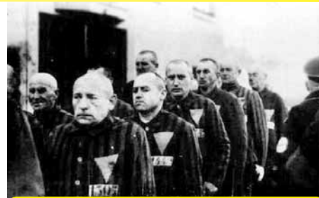
Homosexual victims of Nazis

On 27 January 2005, Europe marked the 60 th anniversary of the liberation of the Nazi death camp at Auschwitz-Birkenau, and in many countries it was also a Holocaust Memorial Day. Alongside with Jewish, Roma and Slavic people, political opponents, and disabled people, thousands of homosexual people were tortured and killed by the Nazis.