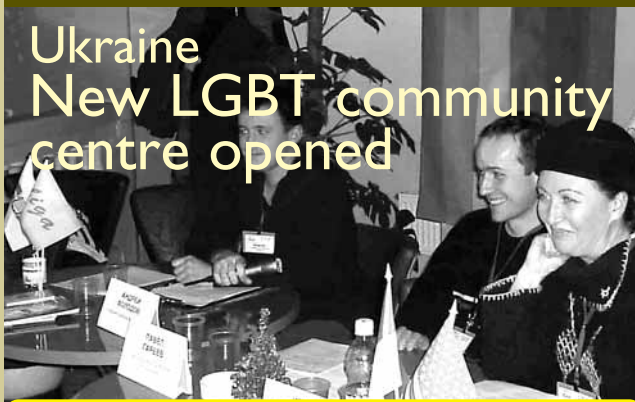
Press conference in Nicolaev

Last December the Nicolaev Association of Gays, Lesbians and Bisexuals (LIGA) in Southern Ukraine held a press conference launching the project "Establishing of the Centre for MSM in the city of Nicolaev". The purpose of the project is to increase the legal and medical literacy of the LGBT community in the fields of HIV/AIDS, to encourage personal freedoms, and to get involved into advocacy processes. The presentation date marked the 13th anniversary of the repeal of the total ban on male homosexuality in Ukraine. Representatives of NGOs, mass media, as well as medical practitioners from the Nicolaev HIV Centre took part in the event.