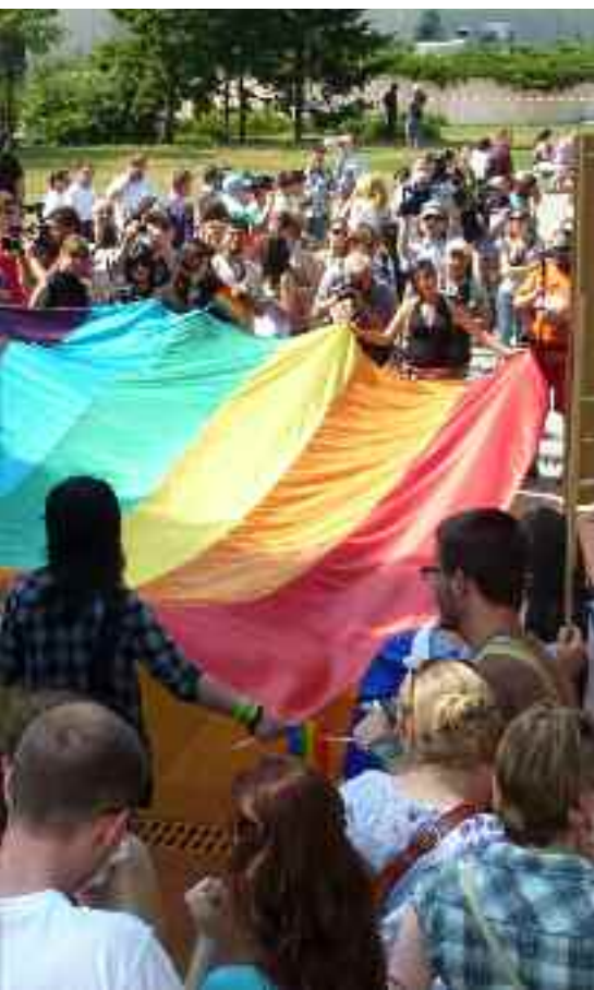
images: Sofia Pride, June 2011.

report crimes like this – because we are already in [the] public [eye]. There are dozens of people who get attacked for the same reasons, but don't report it."