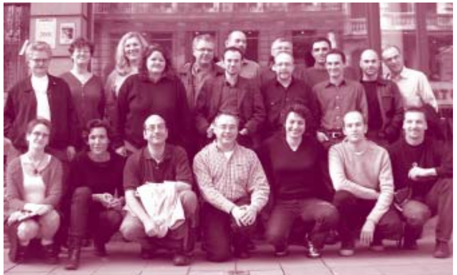
Participants of the second meeting of the EU National Co-ordination network in Brussels

In the process of monitoring the implementation of the Framework Directive ILGA-Europe has collaborated with the European Disability Forum (EDF), the European Older People's Platform AGE and the European Network against Racism (ENAR). The co-operation mainly seeks to inform each other on strategies and tools for monitoring and to explore ways of working together. At the Network meeting in April the national co-ordinators were encouraged to strengthen the co-operation with national members of the European NGOs and trade unions.