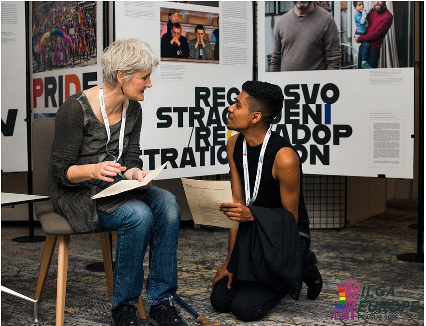
Inter-generational links seemed to emerge through conversations

The inter-generational links seemed to emerge through conversations — people talking about what had been developed because some previous work had been accomplished, people sharing what had worked in their context as a possibility for a newer organisation. So the generational learning included individuals and organisations... people passing on, people keen to build on earlier work. There was both a sense of appreciation of what had been done and of letting new ideas/techniques/approaches be ‘what works’. This seemed very apt to the theme of learning how to be stronger together.