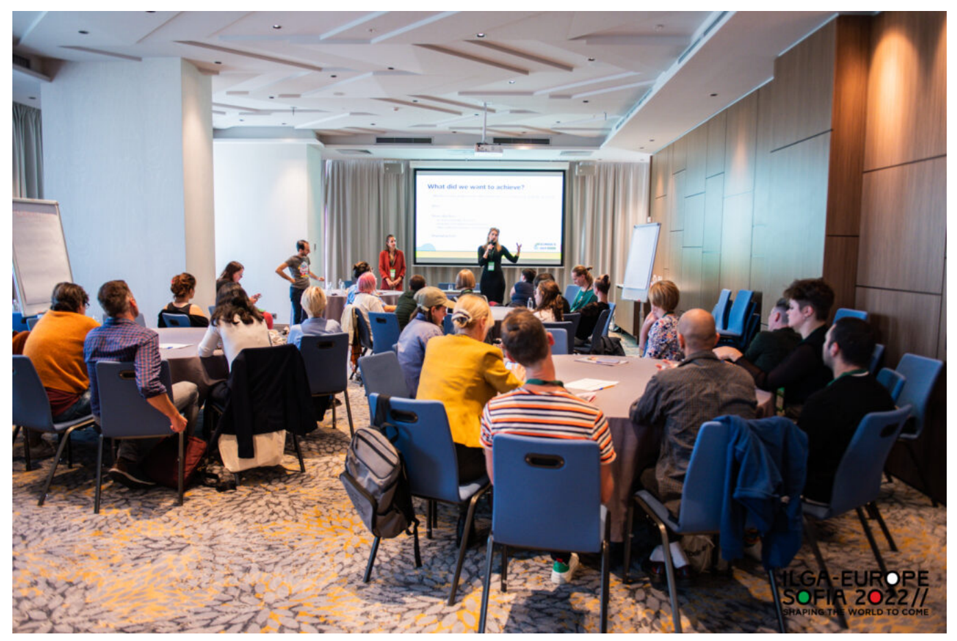
Workshops throughout the day were full of great and vital discussion

Towards the end the morning, there was a vital workshop about how humanitarian actors can understand what they need to do for LGBTI communities in a crisis, from providing shelter to translating information in local languages and much more. In parallel, other participants filled the room of the 'LGBTI Activism in the Face of Judicial Harassment' workshop, where activists from Poland and Turkey shared their experiences of abuse and harassment in the legal system, which has led some activists to leave activism and even their country.