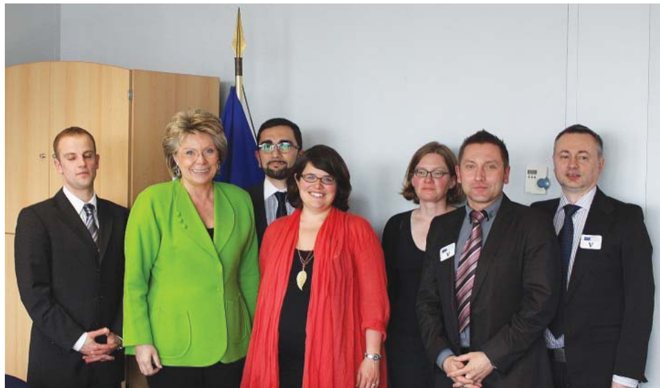
Commissioner Reding with representatives of ILGA-Europe secretariat and membership

ILGA-Europe delivered a call for such a Roadmap to Viviane Reding, the Vice-President of the European Commission and EU Commissioner for Justice, Fundamental Rights and Citizenship on 17 May 2011, the International Day against Homophobia and Transphobia. During this meeting ILGA-Europe highlighted the extent of the problems that LGBT people still face within the European Union and discussed three serious issues with the Commissioner, namely, the lack of mutual recognition of the civil status of same-sex couples across the EU and the negative impact this has on the couples and their children; the difficult situation that the Lithuanian Gay League finds itself in due to the homophobic and transphobic positions taken by various governmental and political actors; and the multitude of problems and discrimination which trans people face in all spheres of life due to lengthy and invasive gender recognition procedures.