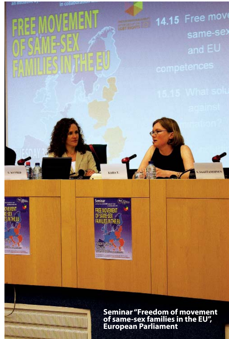
Seminar "Freedom of movement of same-sex families in the EU", European Parliament

Following the submission of this paper, ILGA-Europe worked hard to ensure that this issue receives due attention from politicians and policy makers. Thus, in order to strengthen its call for greater mutual recognition, ILGA-Europe worked in cooperation with the European Parliament's Intergroup on LGBT Rights and in May 2011 co-organised a seminar focusing on freedom of movement for same-sex couples within