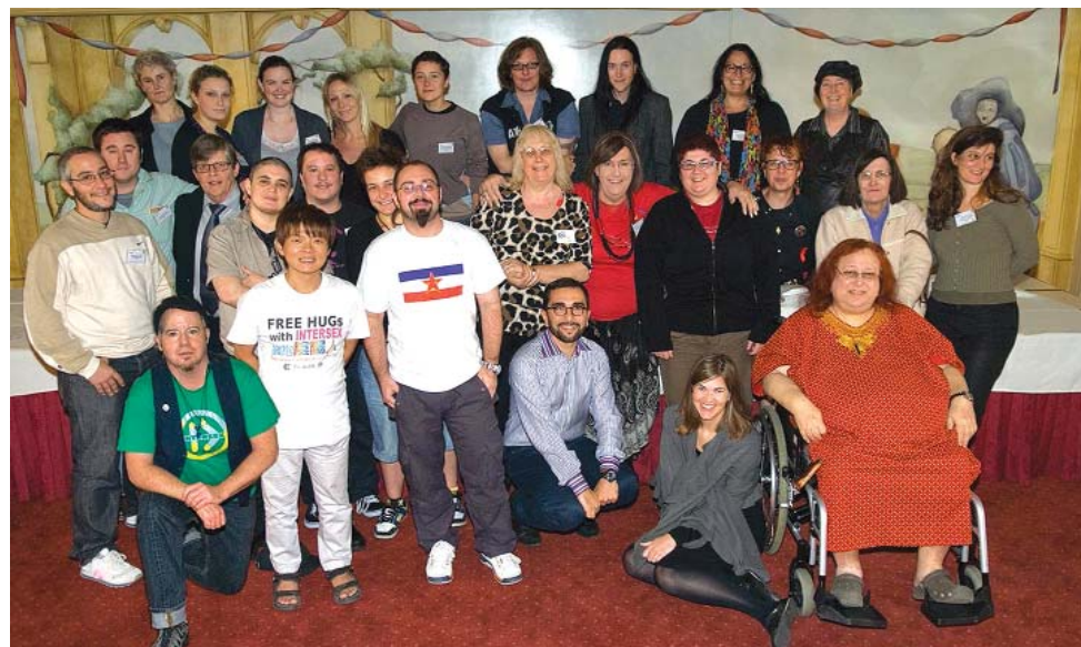
Participants of the First Intersex Forum

ILGA-Europe, together with ILGA World, organised and sponsored the first International Intersex Organising Forum. This historic event in Brussels brought together 24 activists representing 17 intersex organisations from all regions of the world. The Forum agreed on the demands aiming to end discrimination against intersex people and to ensure the right of bodily integrity and self-determination. This newly established informal network will work for the respect of intersex people's human rights at international, regional and national levels. The next meeting of the Forum is expected to take place towards the end of 2012.