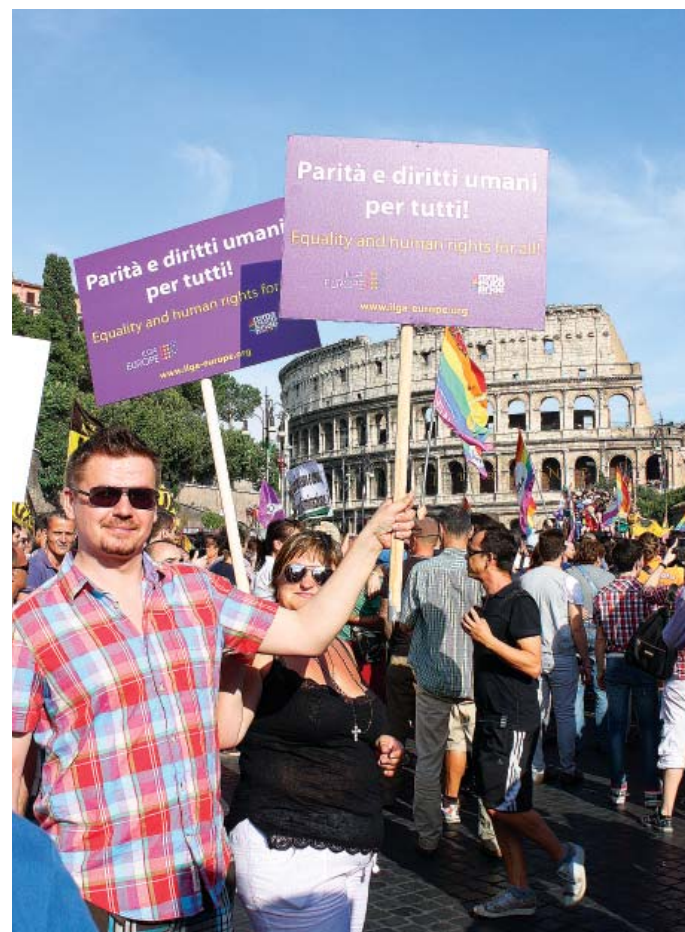
ILGA-Europe at Europride 2011 in Rome

ILGA-Europe's representatives took part in and spoke at Pride in Split (Croatia). The participants of its events were subjected to violent attacks by protesters due to inadequate police protection and ILGA-Europe called on the Croatian authorities to undertake a proper investigation.