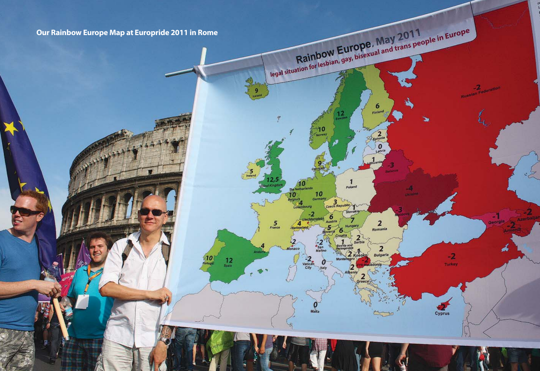
Our Rainbow Europe Map at Europride 2011 in Rome