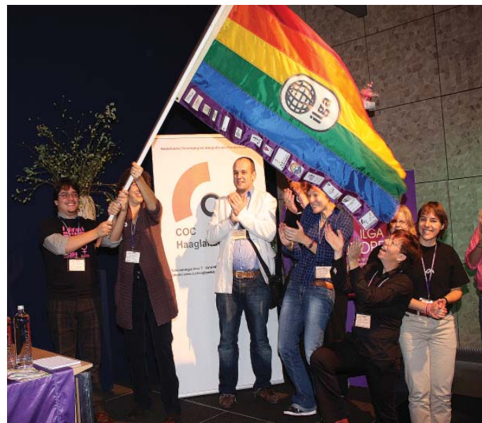
ILGA-Europe's Annual Conference 2010 in The Hague; our flag is being handed to co-hosts of the Annual Conference 2011 in Turin

In addition to sharing of knowledge and discussions on topical European level LGBTI issues and concerns in panels and workshops, the Annual Conference provides the opportunity for member organisation to organise workshops related to their specialised themes of interest as well as 'self-organised spaces' which are usually more strategy oriented.