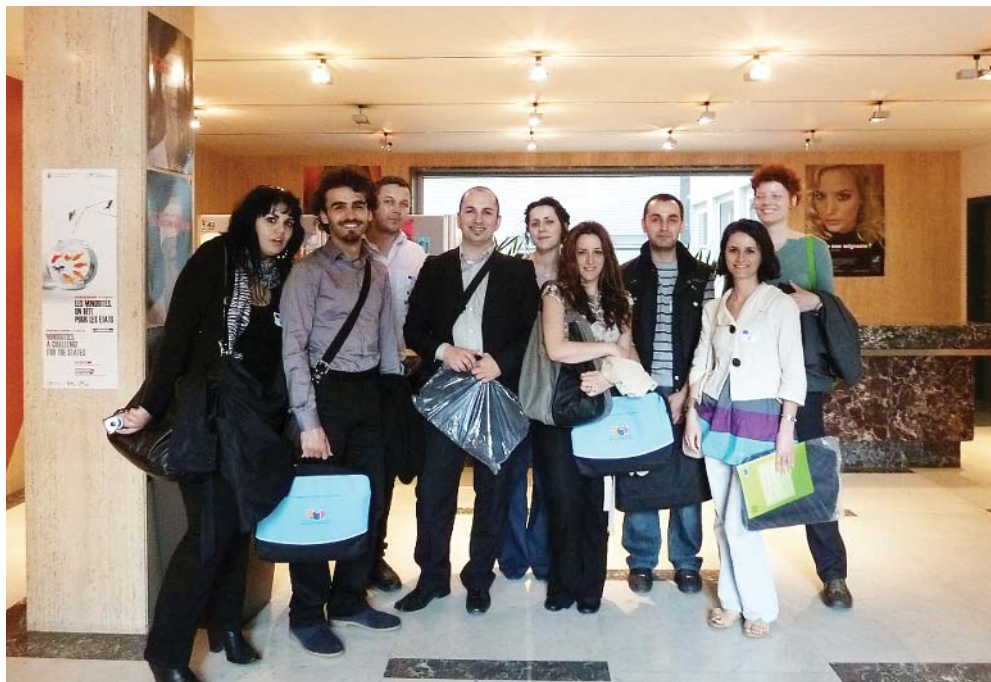
Balkan activists in Brussels

Furthermore, ILGA-Europe organised a training session on human rights monitoring and advocacy in Podgorica for the partner organisation in Montenegro. An ILGA-Europe staff member also participated and spoke in a conference on LGBT rights organised by the partner organisation Juventas.