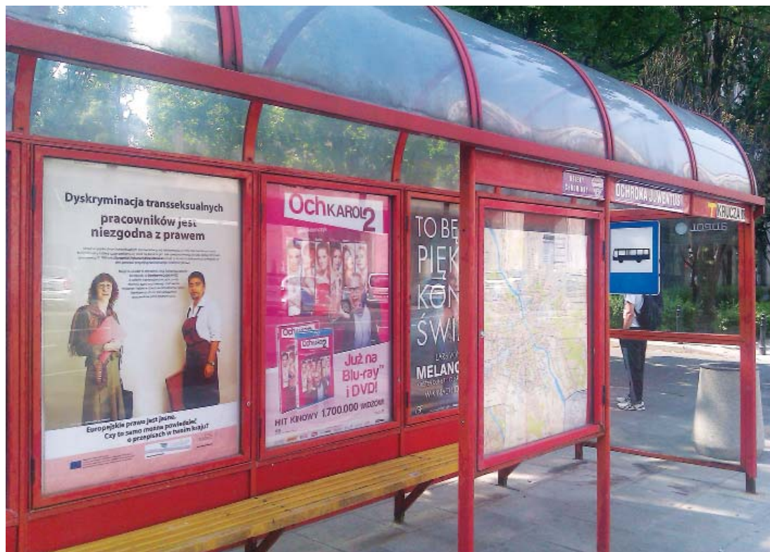
ILGA-Europe's poster "Discrimination against transsexual employees is illegal" translated and displayed in Poland

ILGA-Europe worked closely with Transgender Europe (TGEU) in the preparation of an extensive report on the current implementation of the Gender Recast Directive with regards to trans people's access to employment and vocational training. In preparation for this report, a call for examples of cases of discrimination was circulated widely among the European trans community and ILGA-Europe's EU Network members. Additionally, a survey was sent to all gender equality bodies to assess how they fare with regard to uptake and processing of cases of discrimination against trans people. The compiled report clearly shows that a number of significant gaps remain, and that various EU Member States do not yet meet the minimum requirements of the Directive. ILGA-Europe and TGEU thus made a number of recommendations to the European Commission for effective monitoring of the transposition of the Directive. Under the same round of monitoring, ILGA-Europe along with OII-Germany, also called on the European Commission to look into employment discrimination against intersex people.