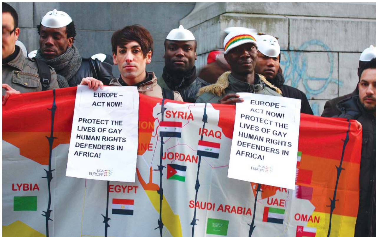
Demonstration outside Belgian foreign ministry in Brussels following the murder of Ugandan activist David Kato