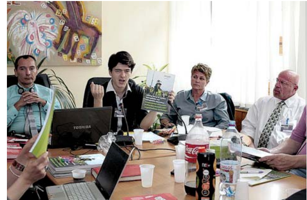
Presentation of ILGA-Europe's toolkit on working with the police

This project, led by the Danish Institute for Human Rights, and participated in by a number of ILGA-Europe's members provided methodology innovations that are now available for further dissemination. In the same field, ILGA-Europe joined a project called "Facing Facts!" , which is also addressing reporting and monitoring of hate related incidents. This initiative will look at the similarities between different types of hate/bias violence (homophobia and transphobia, but also racism and anti-Semitism) and propose new common advocacy and policy tools building on the experience of organisations working in different fields. It is coordinated by Jewish Contribution to an Inclusive Europe (CEJI).