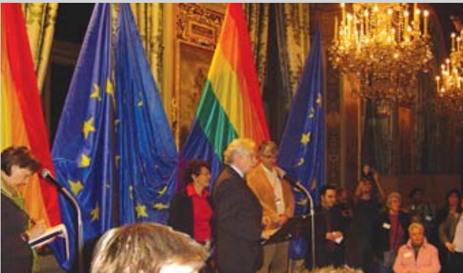
Vice-mayor of Paris addressing conference participants at Town Hall