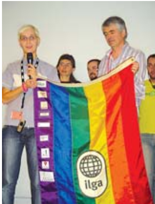
Paris organisers hand over ILGA-Europe flag to organisers of next conference in Sofia

Our annual conference in Paris was very rich in proposals and discussion. So during the December board meeting we have had some preliminary discussion around the conference and the issues raised. It seemed to us that there was a rather clear indication about three issues that need to be addressed in order to put forward appropriate proposals in Sofia.