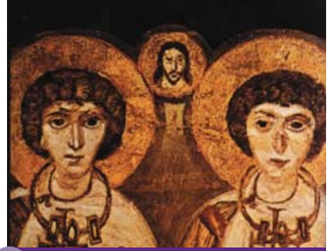
St. Serge & St. Bacchus

In 1991, the kyriarchal church sanctioned, almost encouraged, discrimination against gay and lesbian persons in certain areas including teaching, coaching, the military and other forms of employment.