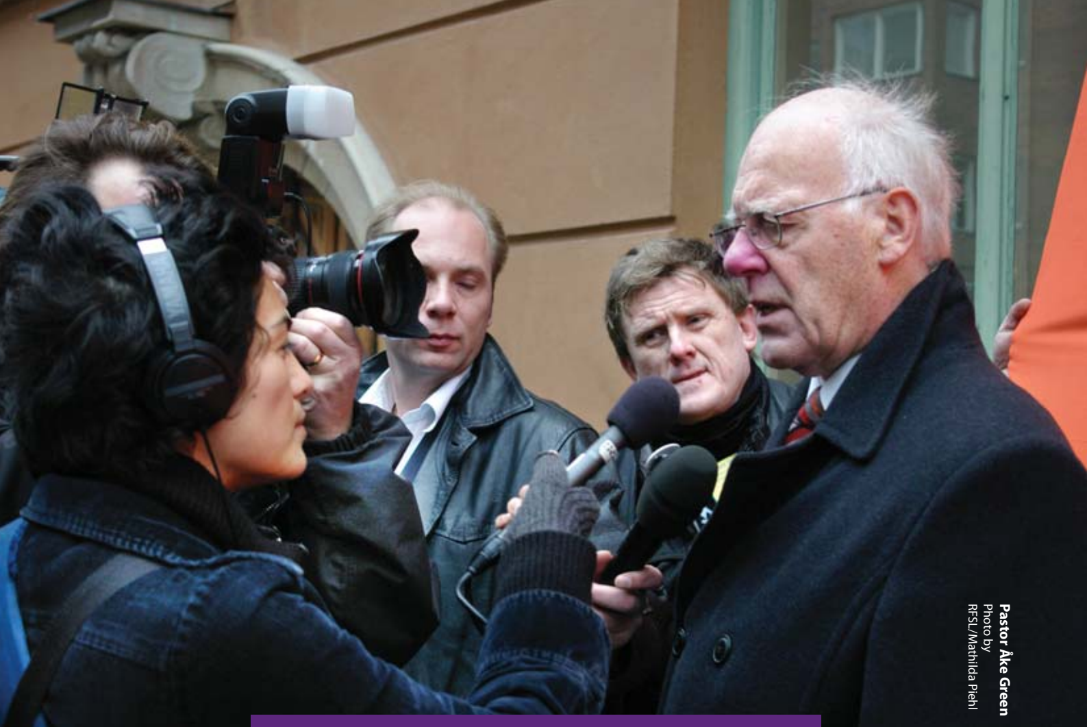
Pastor Åke Green